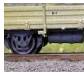
Details from brakes and stakes