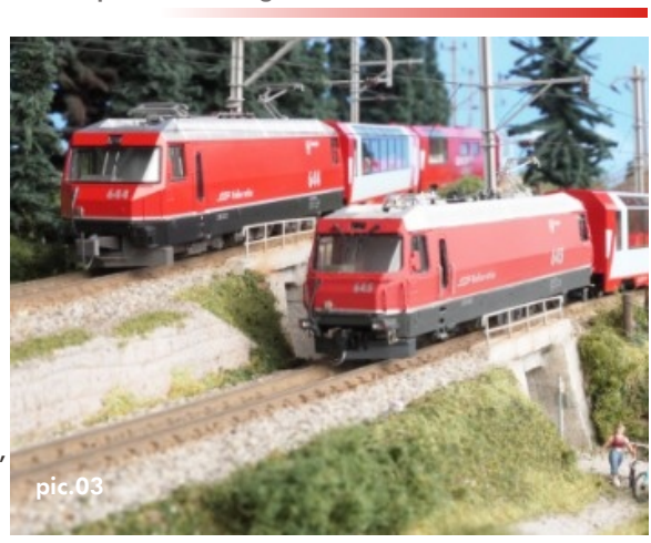
One style of loco, two scales, two manufacturers both have their own advantages.