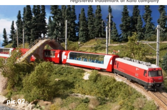
A nice view of our Nm-loco in front of a series of Kato-panorama-wagons.