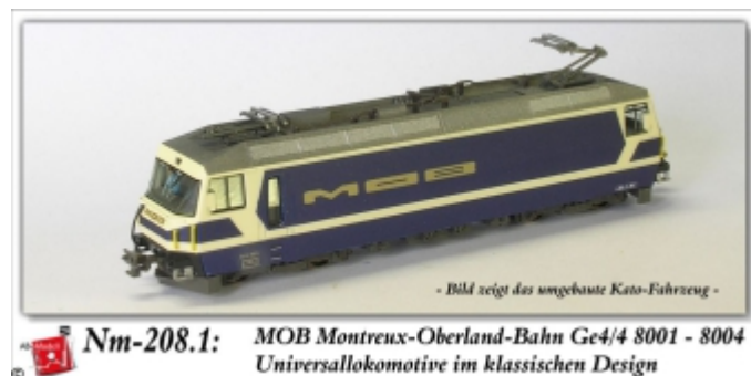
Nm-208.1: MOB Montreux-Oberland-Bahn Ge4/4 8001 - 8004 Universallokomotive im klassischen Design

We had planned to announce the prices during toy fair. Now we have decided to lengthen the early-order-phase to the 30th of June 2016.