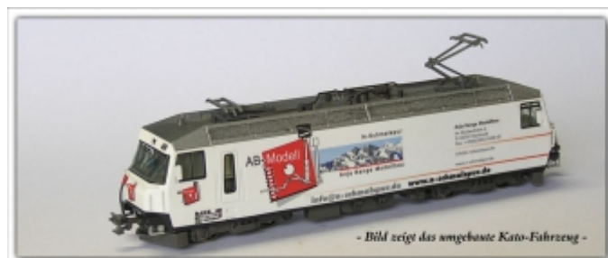
Nm-209.1: Ge4/4''' 659 Jubiläumloco 20 Jahre AB-Modell Fantasiemodell, Metallmodell mit 2 Faulhaber-mot.

The roof is weathered lightly (optional without weathering possible).