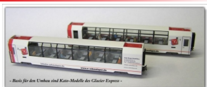
KT-020.2Nm: AB-Modell Jubiläumzug, Zwei-Wagen-Set (1./2. Klasse) für N-Meterspur (Nm)

The jubilee-loco gets hand-grab-rails on all versions of this item, independent if Kato- or finescale-model.