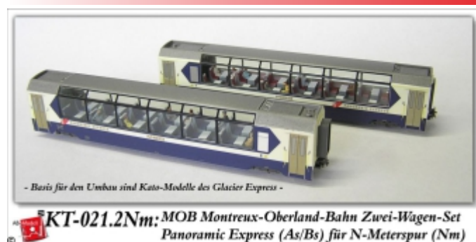
KT-021.2Nm: MOB Montreux-Oberland-Bahn Zwei-Wagen-Set Panoramic Express (As/Bs) für N-Meterspur (Nm)

2 Vorbehaltlich Lieferbarkeit und Preisänderungen durch Kato