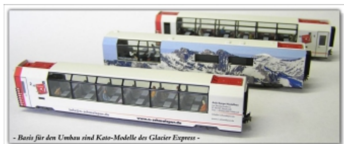
KT-020.3Nm: AB-Modell Jubiläumzug, Drei-Wagen-Set (1./2. Klasse + Speisewagen) für Meterspur (Nm)