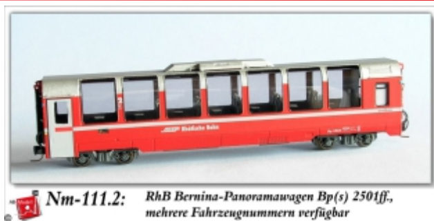
Nm-111.2: RhB Bernina-Panoramawagen Bp(s) 2501ff., mehrere Fahrzeugnummern verfügbar