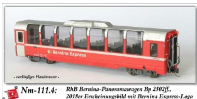
Nm-111.4: RhB Bernina-Panoramawagen Bp 2502ff., 2018er Erscheinungsbild mit Bernina Express-Logo