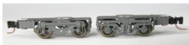
Bogie of the Ap, in comparison with that of the Bp

Just for the sake of completeness it should be mentioned that our models need a suitable narrow gauge track in the gauge 6.5mm. A use on 9mm N-track is not possible. The vehicles are kept in exact scale 1: 160 and equipped with elaborate interior.