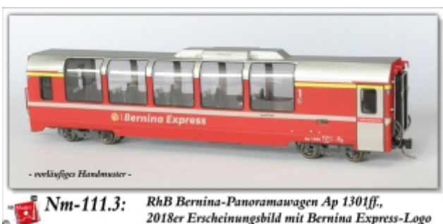
Nm-111.3: RhB Bernina-Panoramawagen Ap 1301ff., 2018er Erscheinungsbild mit Bernina Express-Logo