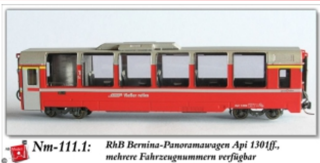
Nm-111.1: RhB Bernina-Panoramawagen Api 1301ff., mehrere Fahrzeugnummern verfügbar

The panorama cars of the Bernina Express in the most up-to-date lettering variant, on the way through the Albula valley in the direction of the Bernina line.