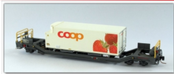
Nm-019.6: RhB Sbk-v 7701, Tragwagen mit Coop-Kühlcont. Motiv Erdbeere (Kunststoff, Minitrix), für Nm (6,5mm)