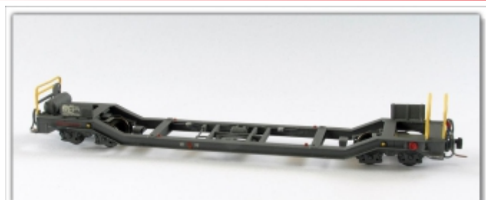
Nm-019.0: RhB Sbk-v 7701, Tragwagen für ISO-Norm-Wechselbehälter oder 20'-Container, Metallmodell für Nm (6,5mm)