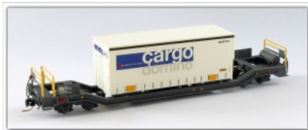
Nm-019.3: RhB Sbk-v 7701, Tragwagen mit cargo domino-Wechselbehälter (Kunststoff, Fleischmann), für Nm (6,5mm)