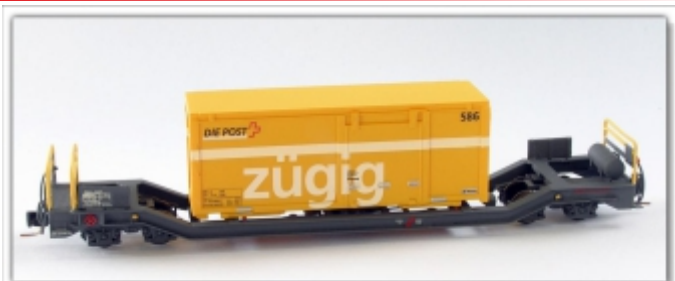
Nm-019.2: RhB Sbk-v 7701, Tragwagen mit PTT-Wechselbehälter (Kunststoff, Arwico), Metallmodell Nm (6,5mm)