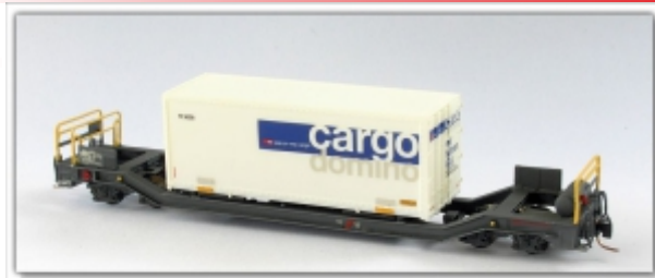
Nm-019.4: RhB Sbk-v 7701, Tragwagen mit cargo domino-Wechsel-Koffer (Kunststoff, Fleischmann), für Nm (6,5mm)