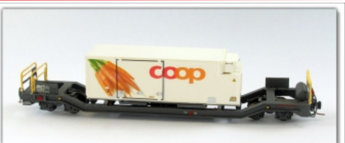
Nm-019.7: RhB Sbk-v 7701, Tragwagen mit Coop-Kühlcont. Motiv Karotte (Kunststoff, Minitrix), für Nm (6,5mm)