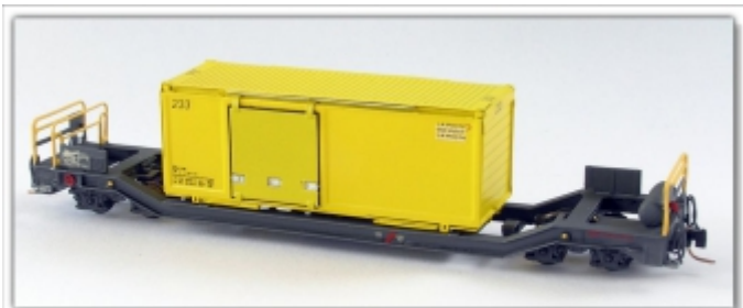
Nm-019.1: RhB Sbk-v 7701, Tragwagen mit PTT-Wechselbehälter (Messing, Loks Schlosserei), Metallmodell Nm (6,5mm)