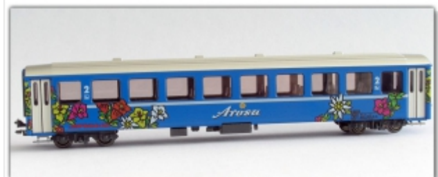
PI-9210.Nm: RhB B2319 Arosa-Express, Spur Nm (6,5mm), mit Kato-Kurzkuppl., Pirata-Modell, Basis Kato EW I

new decorated standard coach I in RhB-Arosa Express B2319 manufacturer Pirata based on Kato-2nd class-model track N (9mm) with Kato close-couplers