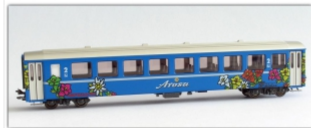
PI-9210.N: RhB B2319 Arosa-Express, Spur N (9 mm), mit Kato-Kurzkuppl., Pirata-Modell, Basis Kato EW I