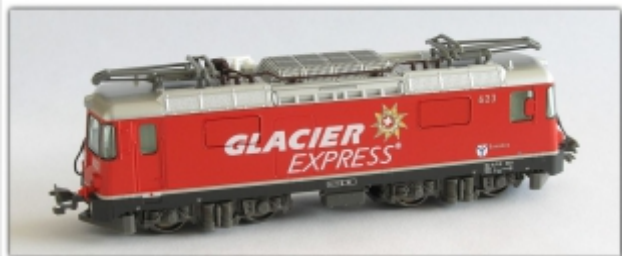
KT-076.1Nm: Ge4/4" 623 „Glacier Express“, umgespurt auf Nm (6,5mm Schmalspur), auf Basis des Kato-Modells

Anja Bange Modellbau Im Stuckenbahn 6 D-58769 Nachrodt Fax: +49(0)2352/3348-62