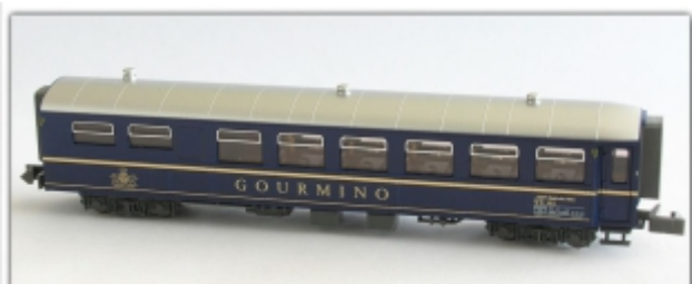
KT-011.1N: WR3811, Speisewagen „Gourmino“, mit beleuchteten Tischlampen, Kato-Modell für Spur N (9mm)

Kato delights model railroaders with a wonderful new design in the form of this dining car, which - in contrast to the usual color scheme of the Rhaetian Railway - is kept in dark blue. The fine engraving of the rivets is just as well done as the "inner" values. The model is equipped as standard with a lighting system for the indicated table lamps.