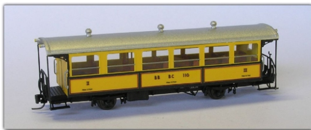
Nm-106.1: RhB historischer Zweiachser der Berninabahn BC110 - aktueller Zustand, Club 1889

Track Nm = 6,5 mm MTL-couplers Chassis from metal Newsilver, casted brass and STL-roof Browned wheelsets, pointed Easy rolling Detailed brakeshoes Minimumradius 195 mm Weight approx. 9,8 g To be delivered from: Q.IV/2014