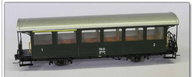
Nm-106.3: RhB Zweiachser der ehemaligen Berninabahn AB 2 1411 ff.

As above Without window bars Seven different road- Numbers available To be delivered from: Q.IV/2014