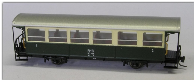
Nm-106.2: RhB Zweiachser der ehemaligen Berninabahn BC 1411 ff.

As above Without roofventilator Without batterybox Without roof-powersupply Closed front and back windows Available roadnumbers: BC 1411, 1412, 1414, 1415, 1416, 1418, 1419 To be delivered from: Q.IV/2014