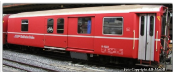
KT-013.1N: RhB - vierachsiger Gepäckwagen mit großem Tor, DS 4223, Kato-Modell für Spur N