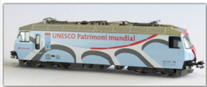
KT-005.31N: RhB Ge4/4 III 650 UNESCO-Welterbe, Sonderserie Kato, Einzellok, Spur N, Standardkupplung

Single locomotive, as originally once available in a set light blue advertising loco for the UNESCO World Heritage Albula-Bernina available as N-gauge model as standard we also offer it as a re-gauged narrow gauge vehicle