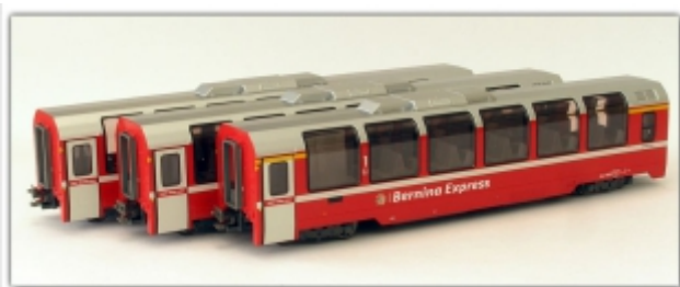
KT-009.4N: RhB Bernina Express-Set mit 3 Panoramawagen 1xA 2xB, Spur N (9mm), Kato-Modell

All models correspond to the usual Kato construction scheme and can be re-gauged to 6.5mm N narrow gauge. We need some time for this work. Thank you for your understanding.