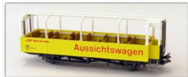
KT-012.1N: RhB - zweiachsiger, offener Aussichtswagen, Bp 2097, Kato-Modell für Spur N

Occasionally, open observation cars are added to the trains, which offer a special travel experience in the fresh air. The open observation cars are also used in the Rail-Rider (Albula valley) or in the Rhine gorge and can run on the Bernina line as well as on the entire regular network. For the model railway enthusiast, they are a welcome addition to the rolling stock fleet and can even be found on goods trains when the vehicles are moved from one location to another.