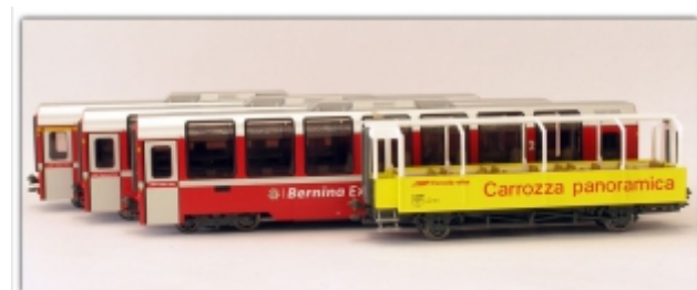
KT-009.5N: RhB Bernina Express-Set mit 3 Panorama- und offener Aussichtswagen, Spur N (9mm), Kato-Mod.

3-piece panorama car set of the Bernina Line with large Bernina Express logo Api1301, Bps2512 and Bp2522 N gauge, optionally also available for Nm