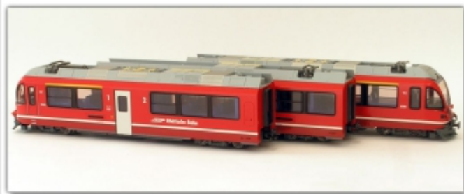
KT-007.4N: RhB ABe8/12 3508, Kato-Modell für Spur N (9mm)

Dual voltage multiple unit of the type Allegra new vehicle number 3508 available as N-gauge model as standard we also offer it as a re-gauged narrow gauge vehicle