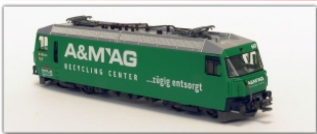
KT-057.3Nm: RhB Ge4/4 III 647, Grösch, A&M Recycling Center, Spur Nm, mit Kato-Kurzkupplung, Basis Kato

The Ge4/4III is the most modern high-performance locomotive of the Rhaetian Railway and has an output of 3,260 hp, which makes it the most powerful locomotive of the RhB. With their large sides, the locomotives are particularly suitable as advertising media. Ge 4/4III 647 was ordered in 1991 and put into service on 20.09.1994. From 2013 to 2016, it advertised for the recycling company A&M AG in Trimmis and was given a striking green livery for this purpose.