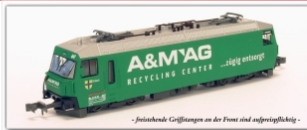
KT-057.3N: RhB Ge4/4 III 647, Grösch, A&M Recycling Center, Spur N, mit N-Standard-Kupplung, Basis Kato

Art.-Nr./item-no./produit-no. based on Kato model, repainted and redecorated scale 1:150 for track gauge 6,5mm (Nm) fronts with free standing handrails Kato close coupling