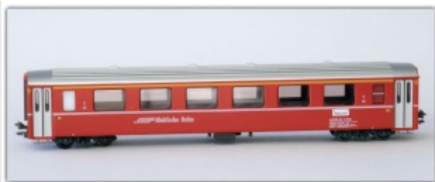
PI-9201.Nm: RhB A(WR-S)223 Restaurant, Nm (6,5mm), mit Kato-Kurzkuppl., Pirata-Modell, Basis Kato EW I

Makeshift dining car based on the EW I repainting by Pirata based on the Kato EW I regauged to narrow (Nm gauge = 6,5mm) by AB-Modell with Kato close coupling in attractive hinged box