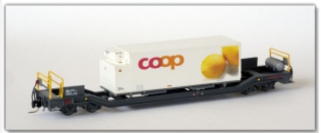
Nm-019.14: RhB Sbk-v 7713, Tragwagen mit Coop-Kühlcontainer Motiv Zitrone (Kunststoff, Minitrix), für Nm (6,5mm)

four-axle carrier wagon Sbk-v 7713 loaded with Coop swap body motive lemon Nickel silver handmade model made in Germany printed plastic container from Minitrix