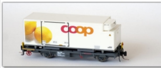
Nm-013.14: RhB Lb-v 7866, Tragwagen mit Coop-Kühlwechselbehälter Zitrone (Minitrix), für Nm (6,5mm)

two-axle carrier wagon Lb-v 7866 loaded with Coop swap body motive lemon Nickel silver handmade model made in Germany printed plastic container from Minitrix