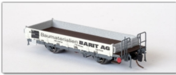
Nm-011.5: RhB Niederbordwagen Kk-w 7324/7325, Messing-Handarbeitsmodell, BARIT AG

two-axle low side gondola Kk-w 7324 or 7325 two different road numbers available brass handmade model made in Germany advertising model of the building material dealer BARIT AG