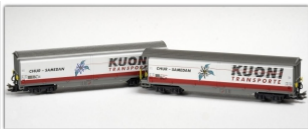
MD-61013.Nm: RhB Wagenset: Haik-v 5132 Kuoni und Haik-v 5133 Kuoni, Spur Nm, MDS-Modell

Sliding wall carriage Haik-v 5128 „Möbel Pfister“ N gauge (9mm) with N standard coupler or optionally Nm gauge (6.5 mm) with a Kato close coupler