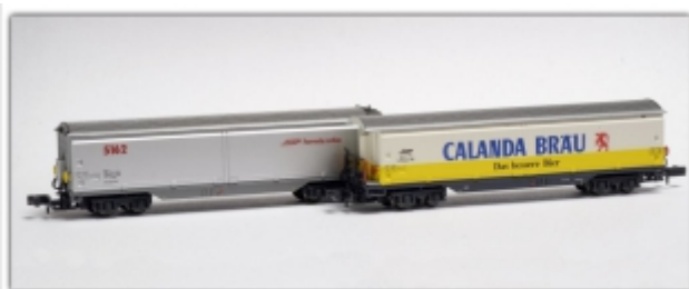
MD-61011.N: RhB Wagenset: Haik-qv 5161 Calanda und Haiqq-y 5162 Silber, Spur N, MDS-Modell

In addition to the goods wagons, the locomotives are also arriving. We will report on this as soon as they are available.