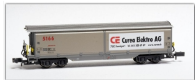
MD-61014.N: RhB Schiebewandwagen Haiqq-qy 5166 Curea Elektro, Spur N, MDS-Modell

Sliding wall carriage set of two Haik-v 5132 and Haik-v 5133 with advertising „Kuoni“ N gauge (9mm) with N standard coupler or optionally Nm gauge (6.5 mm) with a Kato close coupler