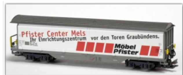
MD-61012.Nm: RhB Schiebewandwagen Haik-v 5128 Möbel Pfister, Spur Nm, MDS-Modell

Sliding wall carriage set of two Haik-qv 5161 Calanda and Haiqq-y 5162 „RhB“, silver N gauge (9mm) with N standard coupler or optionally Nm gauge (6.5 mm) with a Kato close coupler