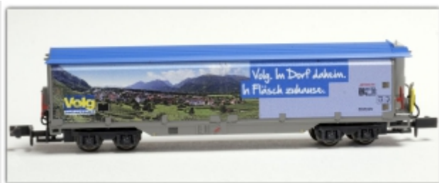
MD-61010.N: RhB Schiebewandwagen Haiqq-tuuz 5174 Volg Motiv Fläsch, Spur N, MDS-Modell

Sliding wall carriage Haiqq-tuuz 5174 VOLG 'VOLG. At home in the village.' Motiv Fläsch N gauge (9mm) with N standard coupler or optionally Nm gauge (6.5 mm) with a Kato close coupler