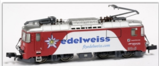
MD-60013.N: RhB Ge4/4" 618 rot, Werbemodell „fly edelweiss“, Spur N (9 mm), mit Rapidokupplung, MDS-Modell

The adjacent advertising locomotive promotes the fund-raising campaign for the re-commissioning of the first steam locomotive of the Rhaetian Railway G3/4 No. 1 'Rhätia'. Every model sold will contribute EUR 5 to the historic RhB's donation fund, which will be used directly for the preservation and recommissioning of these historically valuable treasures.