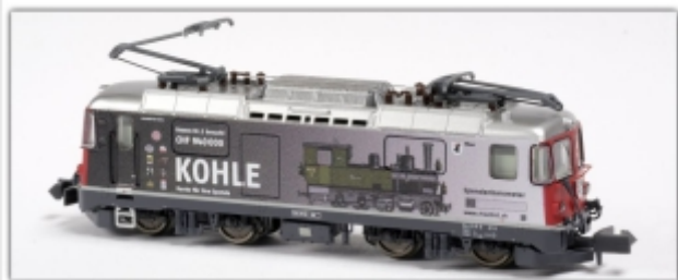
MD-60005.N: RhB Ge4/4" 616, Spendenlok „Rhätia“, Spur N (9 mm), mit Rapidokupplung, MDS-Modell