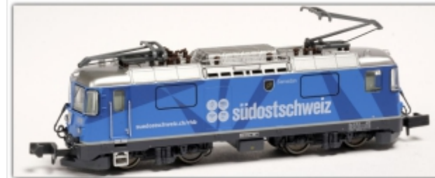
MD-60015.N: RhB Ge4/4" 619 blau, Werbemod. Südostschweiz, Spur N (9 mm), N-Kupplung, MDS-Modell

Digitised models and digital locomotives with sound are also available ex works. Digital drivers should order a digitalised or sound locomotive directly from us, as we do not carry out digital conversions and installations in our workshop.