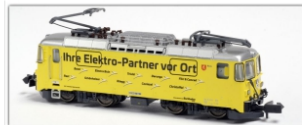
MD-60014.N: RhB Ge4/4" 612 gelb, Werbemod. Burkhalter-Gruppe, Spur N (9 mm), N-Kupplung, MDS-Modell